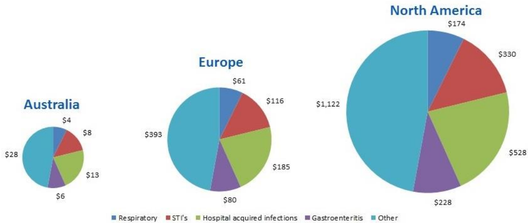
Figure 2. MDx infectious disease market (US$million) for Australia, Europe and North America