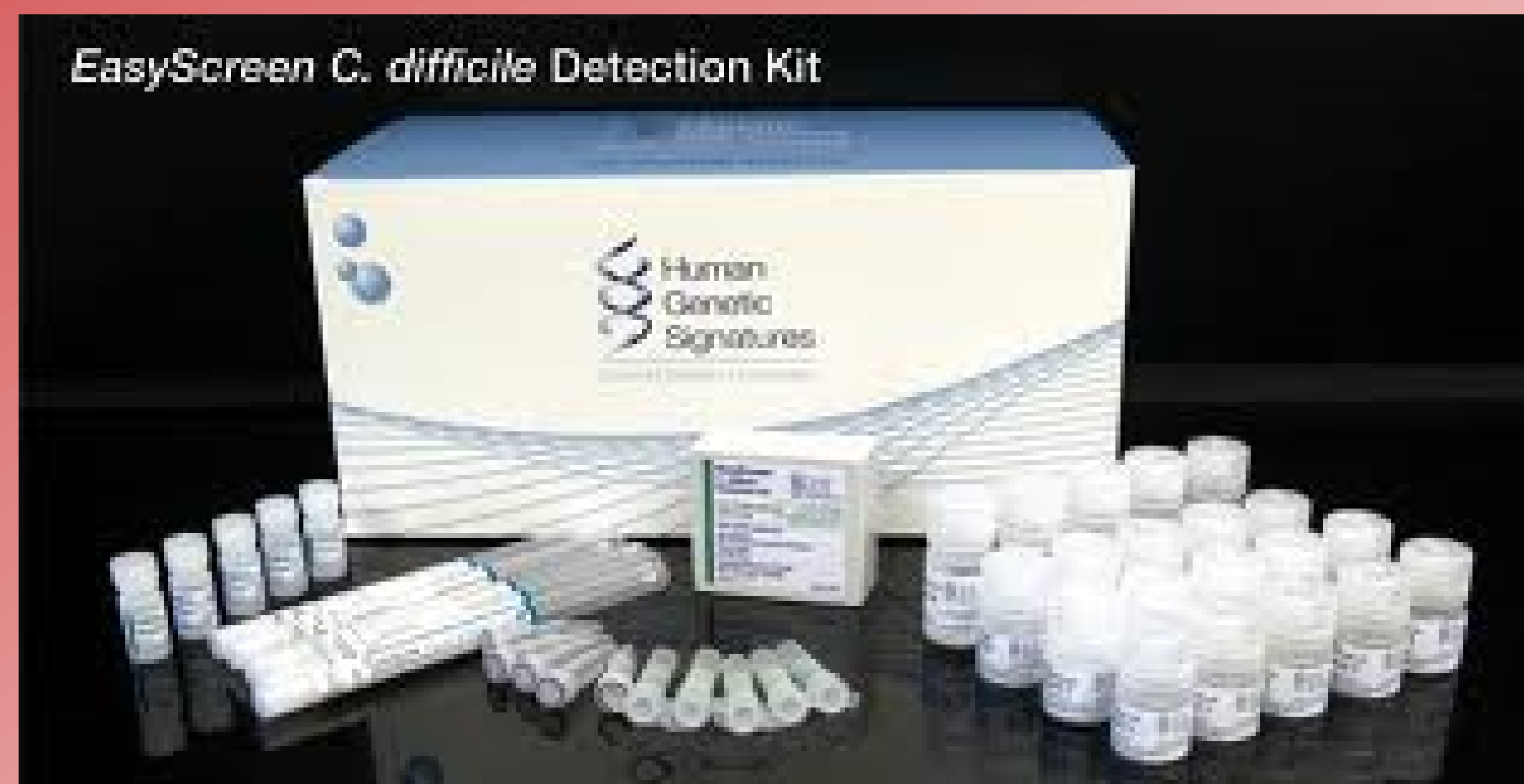
Fig.1. EasyScreen C. difficile Detection Kit.

More severe Clostridium difficile infection (CDI) which originated in North America in the early 2000s has now spread world-wide and it has become vital for a early definitive diagnosis of CDI to made. This has been a driving force behind rapid advances in laboratory-based technologies particularly nucleic acid amplification tests (NAATs) which promise rapid turn around times. This study evaluated the recently developed EasyScreen TM Detection Kit (Fig.1) that uses 3base TM chemistry in which all cytosine bases are converted to uracil to improve the efficiency of RT PCR by reducing the temperature variability in multiplex reactions making it possible to amplify both toxin A and B genes simultaneously for the identification of toxigenic C. difficile . The EasyScreen TM Detection Kit may be used on a variety of RT PCR platforms after either manual or automated extraction.